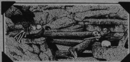
WE DID NOT LIMIT OUR KILLING TO MOROS THESE ARE SKULLS FROM IGOROTES.

IN ONE OF THE ATTEMPTS TO VERIFY THE STATISTICS ON THIS PAGE WE CALLED THE LOS ANGELES PUBLIC LIBRARY INFORMATION SERVICE. THEIR HISTORY EXPERT WAS AMAZED AT THE LACK OF INFORMATION IN REGARD TO CASUALTY NUMBERS. "WE HAVE CASUALTY COUNTS FOR EVERY U.S. INVOLVEMENT BUT THIS ONE!" WAS HER COMMENT. "IT'S AS IF THEY DIDN'T WANT YOU TO KNOW."