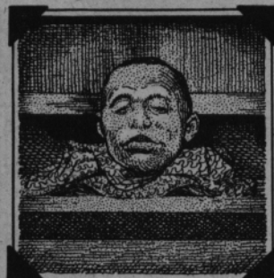
FILIPINOS WHO PAID THE PRICE OF REBELLION.