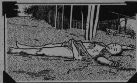
A MORO BOY.

BY OFFICIAL COUNT, 4,000 U.S. ARMY TROOPS WERE KILLED IN THE PHILIPPINES AT THIS TIME (1898-1920), BUT WITH THE SCOUTS (UNOFFICIAL U.S. ARMY MEN & MARINES) INCLUDED, UP TO 44,000 AMERICANS HAVE BEEN ESTIMATED KILLED.