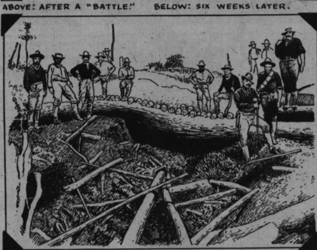
ABOVE: AFTER A "BATTLE!" BELOW: SIX WEEKS LATER.